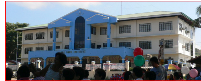
NDI in the new millennium.

In addition, it is such a waste to see deserving but needy students quit school with their potential unrealized—thus the need for scholarship grants. Undeniably, outside resources from individuals and organizations play a significant part in fulfilling the school's obligations and needs.