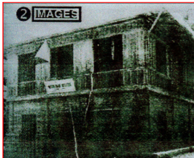
The old Facoma building that housed the fledgeling school.

From humble beginnings in the landmark FACOMA building, the school started with a class for each of the four years in high school. The year 1948 saw the first graduates of NDI. As enrolment grew, new premises were built on